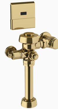
Variation Not Shown: Brushed Nickel